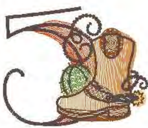
File: DBJJSketchySouthwestNumbers-...-3in Stitches: 12545 Colors: 7/7 Size: 3.66x3.00 " Stops: 6