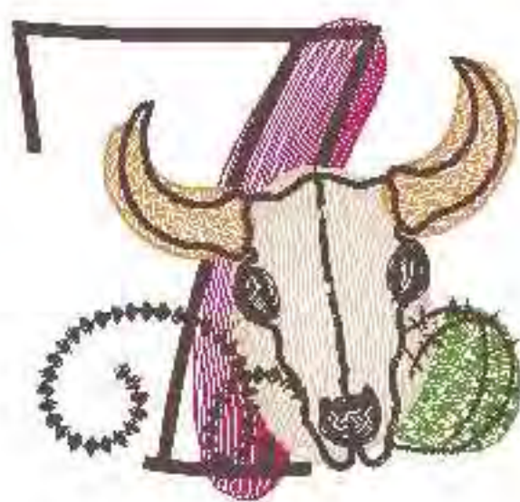
File: DBJJSketchySouthwestNumbers-...-4in Stitches: 11529 Colors: 6/6 Size: 4.08x3.84 " Stops: 5