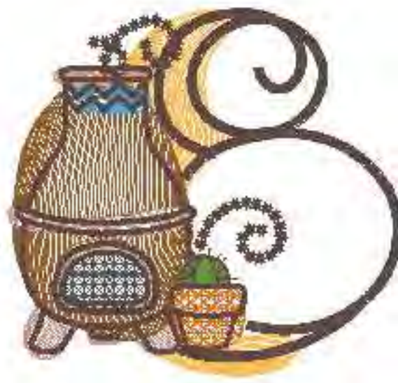
File: DBJJSketchySouthwestNumbers-...-3in Stitches: 9975 Colors: 8/9 Size: 3.22x3.00 "