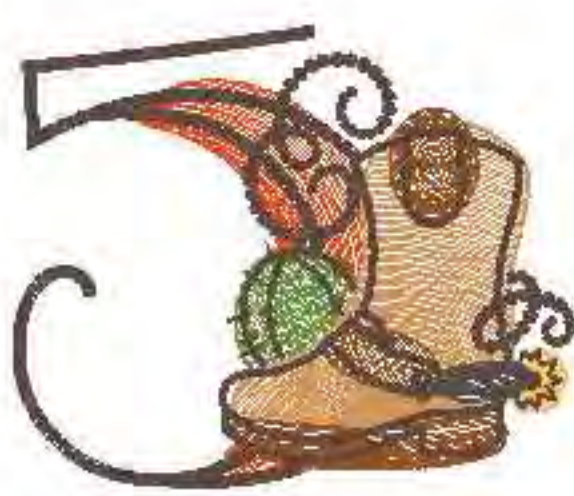
File: DBJJSketchySouthwestNumbers-...-4in Stitches: 16456 Colors: 7/7 Size: 4.70x3.85 " Stops: 6