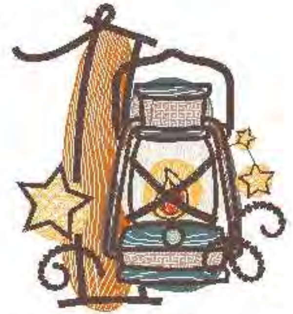
File: DBJJSketchySouthwestNumbers-...-3in Stitches: 11741 Colors: 9/9 Size: 2.67x3.00 " Stops: 8