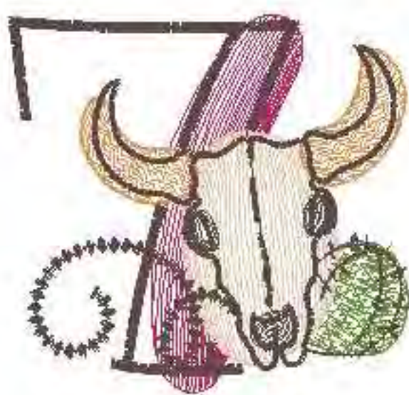
File: DBJJSketchySouthwestNumbers-...-3in Stitches: 8423 Colors: 6/6 Size: 3.18x3.00 " Stops: 5