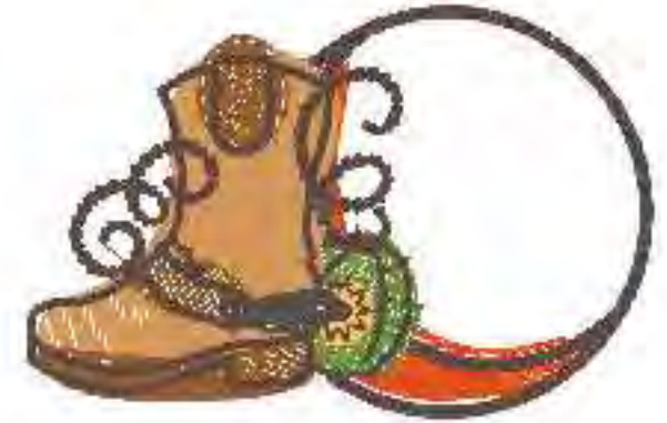
File: DBJJSketchySouthwestNumbers-...-3in Stitches: 13708 Colors: 7/7 Size: 4.56x3.00 " Stops: 6