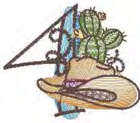
File: DBJJSketchySouthwestNumbers-...-3in Stitches: 10641 Colors: 7/7 Size: 3.56x3.00 " Stops: 6