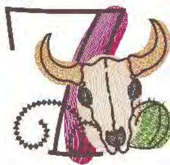
File: DBJJSketchySouthwestNumbers-...-5in Stitches: 15577 Colors: 6/6 Size: 5.08x4.80 " Stops: 5