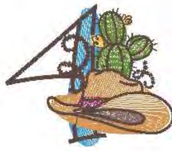
File: DBJJSketchySouthwestNumbers-...-5in Stitches: 18759 Colors: 7/7 Size: 5.70x4.80 " Stops: 6