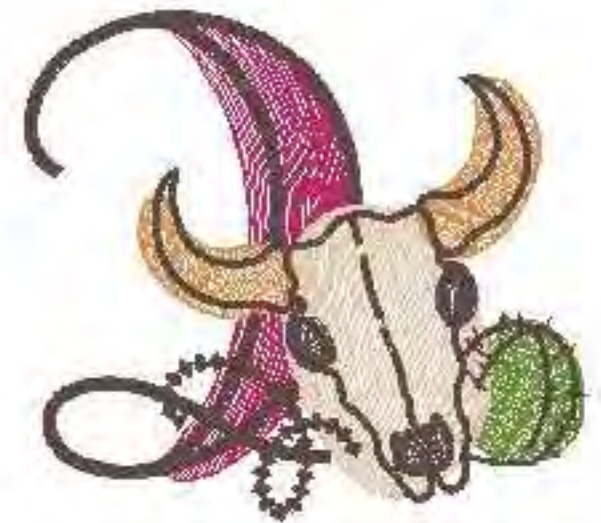
File: DBJJSketchySouthwestNumbers-...-3in Stitches: 8091 Colors: 6/6 Size: 3.32x3.00 " Stops: 5