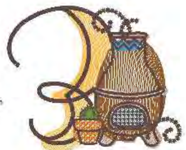
File: DBJJSketchySouthwestNumbers-...-3in Stitches: 9975 Colors: 8/9 Size: 3.58x3.00 " Stops: 8