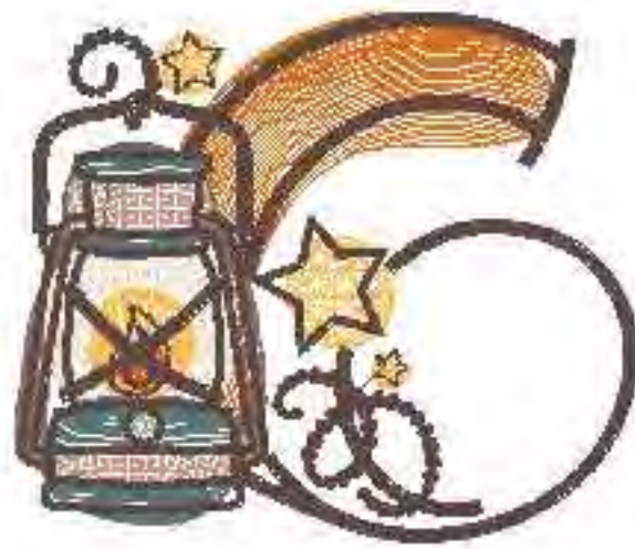
File: DBJJSketchySouthwestNumbers-...-4in Stitches: 16919 Colors: 9/9 Size: 4.54x3.85 " Stops: 8