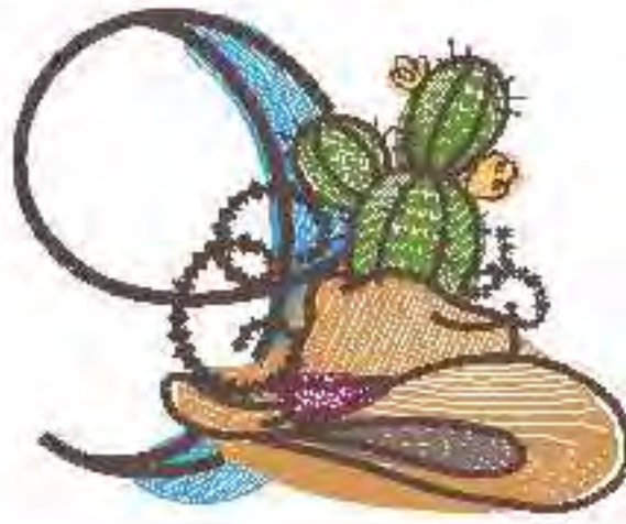
File: DBJJSketchySouthwestNumbers-...-3in Stitches: 11950 Colors: 7/7 Size: 3.70x3.00 "