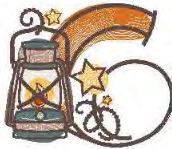
File: DBJJSketchySouthwestNumbers-...-5in Stitches: 21294 Colors: 9/9 Size: 5.66x4.80 " Stops: 8