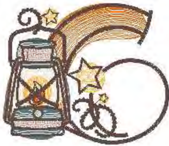
File: DBJJSketchySouthwestNumbers-...-3in Stitches: 13112 Colors: 9/9 Size: 3.54x3.00 " Stops: 8