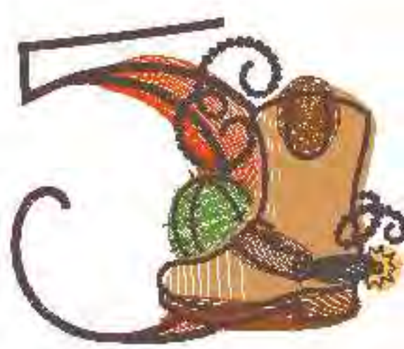
File: DBJJSketchySouthwestNumbers-...-5in Stitches: 19915 Colors: 7/7 Size: 5.86x4.80 " Stops: 6