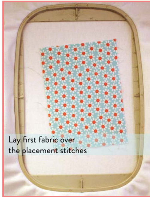
Lay first fabric over the placement stitches

Lay your first fabric down, making sure the entire placement stitch is covered. (You may wish to use a spritz of spray adhesive to help hold it in place.)