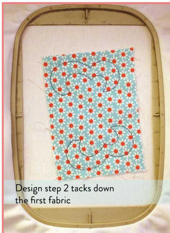
Design step 2 tacks down the first fabric

Run Design Step 2: a double running stitch to attach the first fabric to the item.