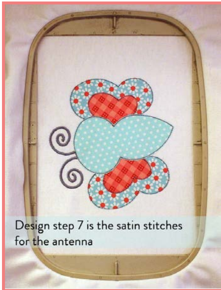
Design Step 7: satin stitches for the antenna