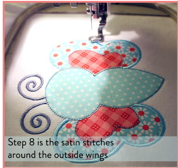
Design Step 8: satin stitches for the outside wings