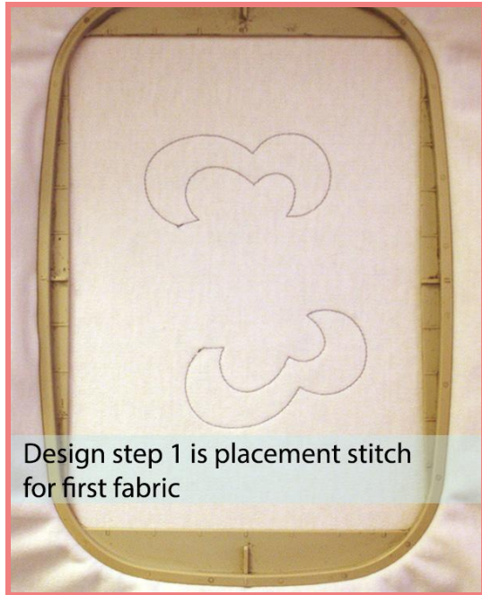
Design step 1 is placement stitch for first fabric

Run Design Step 1: a single running stitch to show fabric placement for the outer wings.