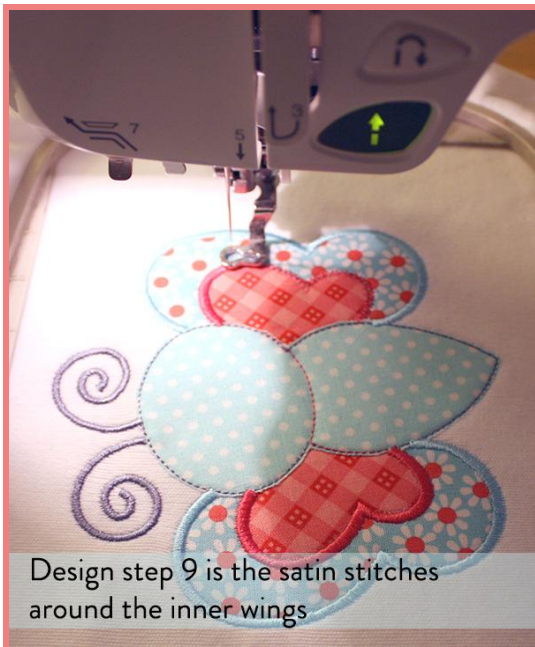
Design Step 9: satin stitches for the inside wings