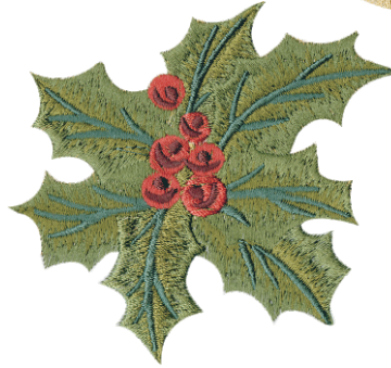
Design - vcc38 Stitches -14292 Size - 4.2" wide - 3.8" high

All thread colors are Floriani Polyester Colors