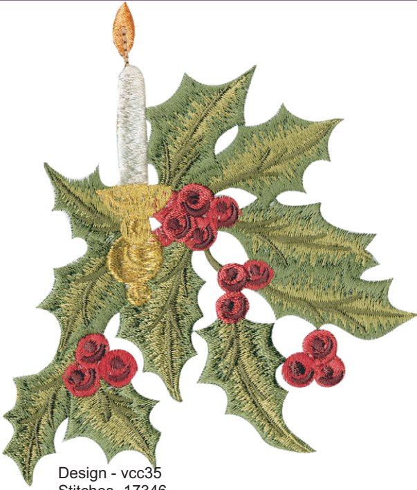
Design - vcc35 Stitches -17346 Size - 4.2" wide - 4.8" high

All thread colors are Floriani Polyester Colors