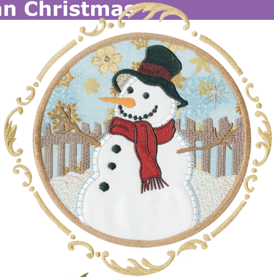
Design - vcc36 Stitches -17296 Size - 4.7" wide - 4.8" high

All thread colors are Floriani Polyester Colors