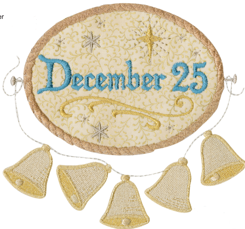
Design - vcc34 Stitches -18531 Size - 3.3" wide - 6.0" high

All thread colors are Floriani Polyester Colors