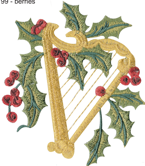
Design - vcc39 Stitches -16612 Size -3.8" wide - 4.4" high

All thread colors are Floriani Polyester Colors