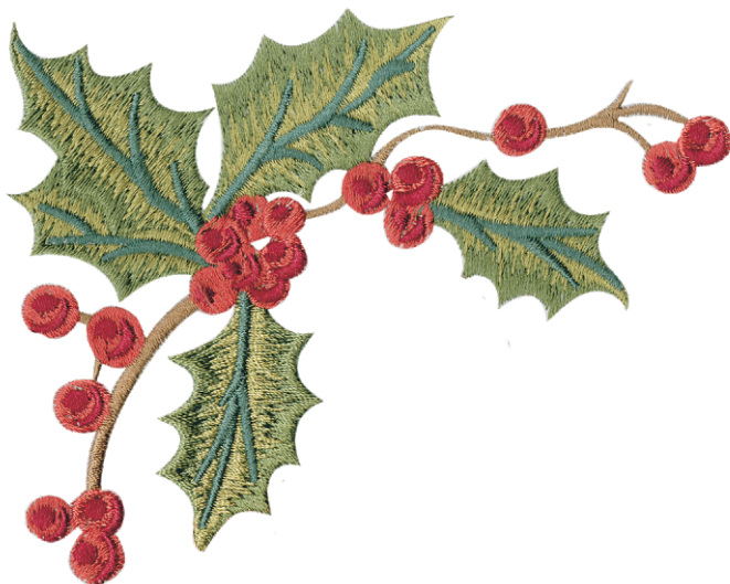
Design - vcc33 Stitches -16692 Size - 5.2" wide - 4.8" high

All thread colors are Floriani Polyester Colors