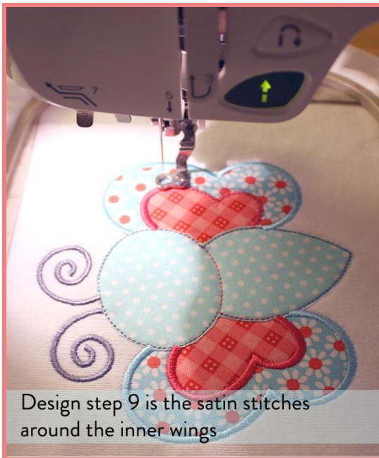
Design Step 9: satin stitches for the inside wings