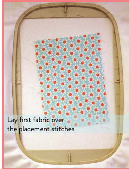
Lay first fabric over the placement stitches

Lay your first fabric down, making sure the entire placement stitch is covered. (You may wish to use a spritz of spray adhesive to help hold it in place.)