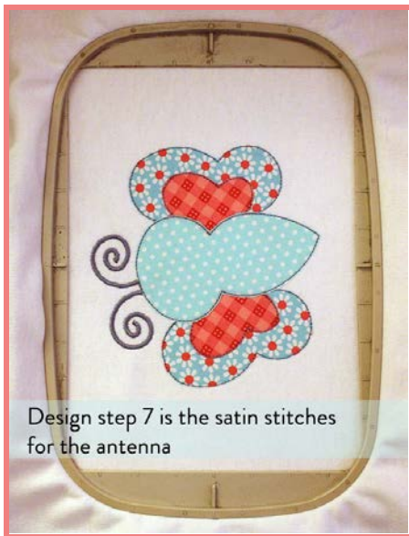
Design Step 7: satin stitches for the antenna